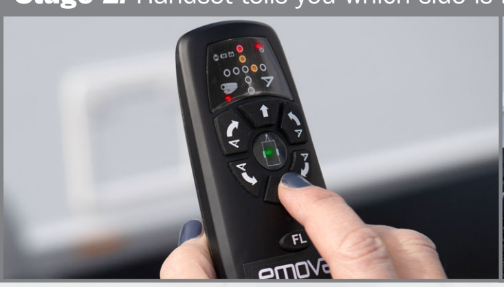
Stage 1: Handset tells you which side is low and place the ramp accordingly.