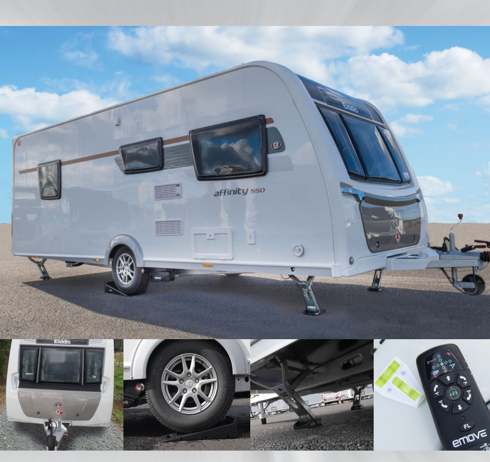
From unhitch to level pitch in 2 minutes

Automatic mover and self levelling system