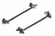
RK Twin Mover Art.-No: 527-0550

Moving device for double axle caravans until 2,500 kg. Simple and easy engaging or disengaging the friction rollers by a control lever.