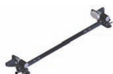
RK Mover Art.-No.: 527-0530

Moving device for single axle caravans until 2,000 kg. Simple and easy engaging and disengaging the friction rollers by a control lever.